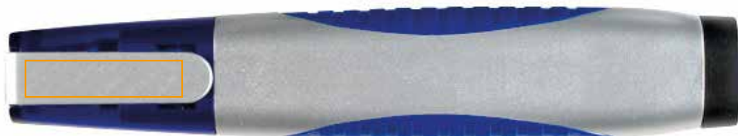
3. ON THE CLIP