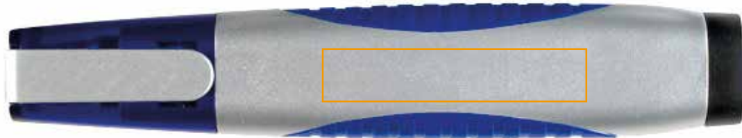
1. IN LINE WITH THE CLIP